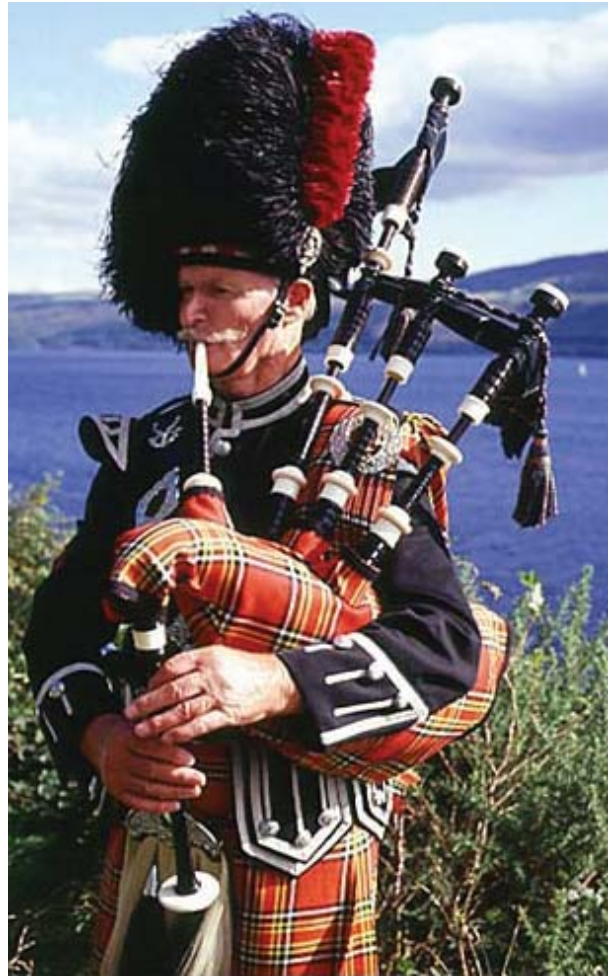
Scottish Highland bag pipe

Scottish reels are mentioned as early as the 16th century. In the 17th century, the Presbyterian church suppressed this exuberant music and dance everywhere except the Scottish Highlands. However, reels reappeared in the Scottish Lowlands after 1700.