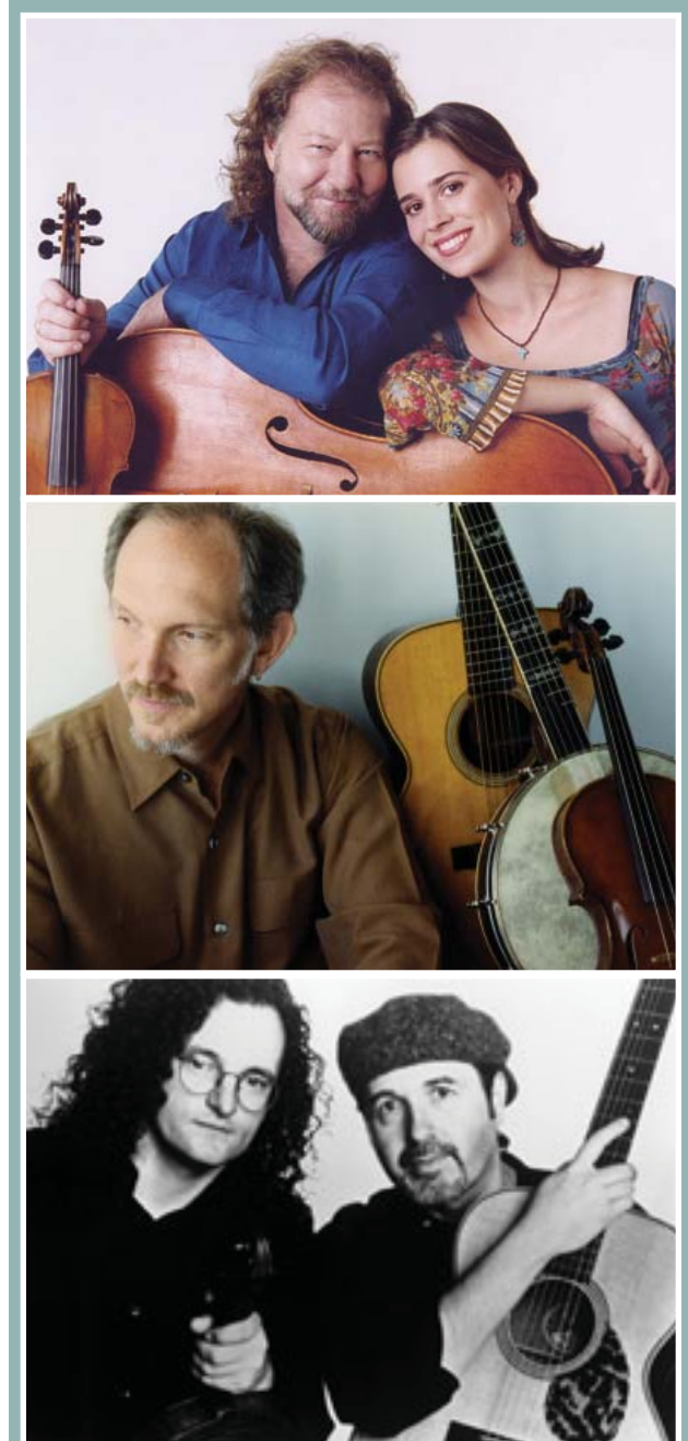
Alasdair Fraser and Natalie Haas; Bruce Molsky; Martin Hayes and Dennis Cahill

Natalie Haas is a Juilliard-trained cellist who began performing with Fraser at the age of 11 at his Valley of